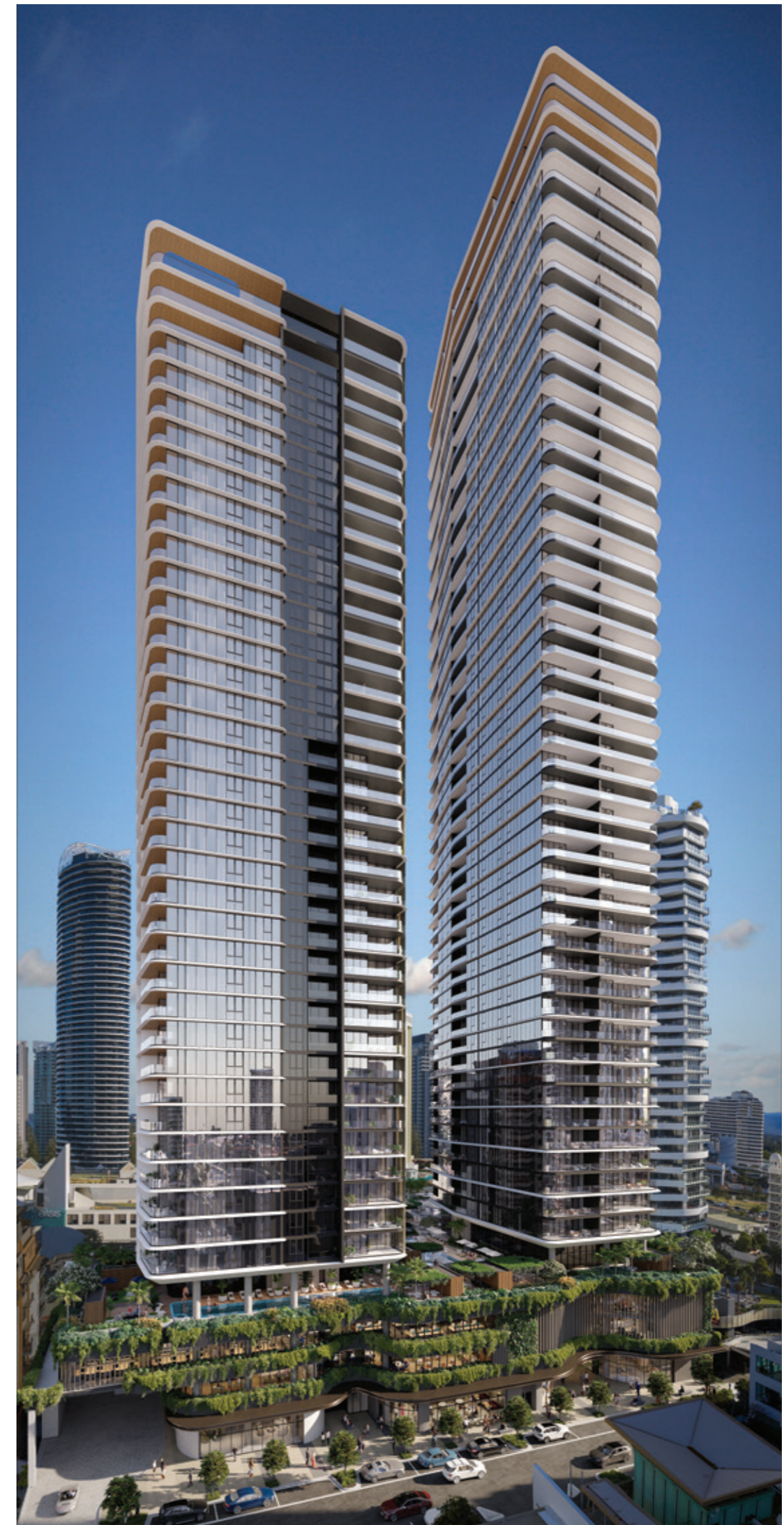
V&A FACADE – ARTIST IMPRESSION

recreational podium, sky residences, private owners only amenity, two levels of premium office space and commercial facilities and a vibrant new retail arcade. It truly is everything and more.