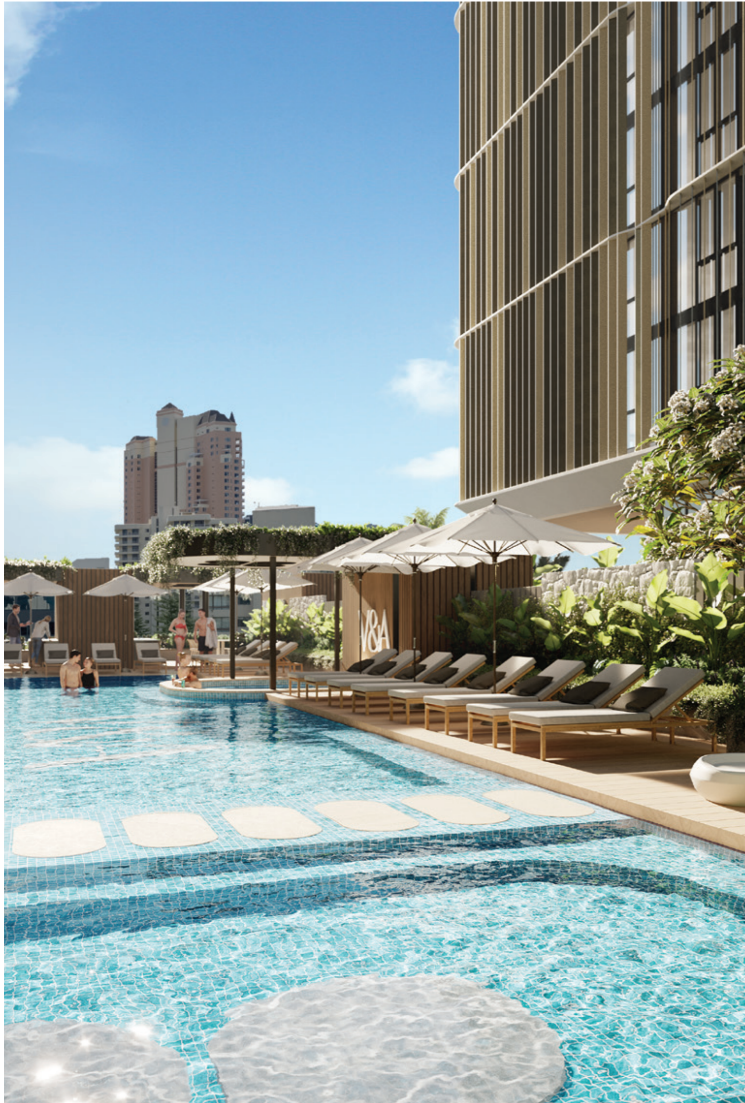
VICTORIA CLUB POOL DETAIL – ARTIST IMPRESSION