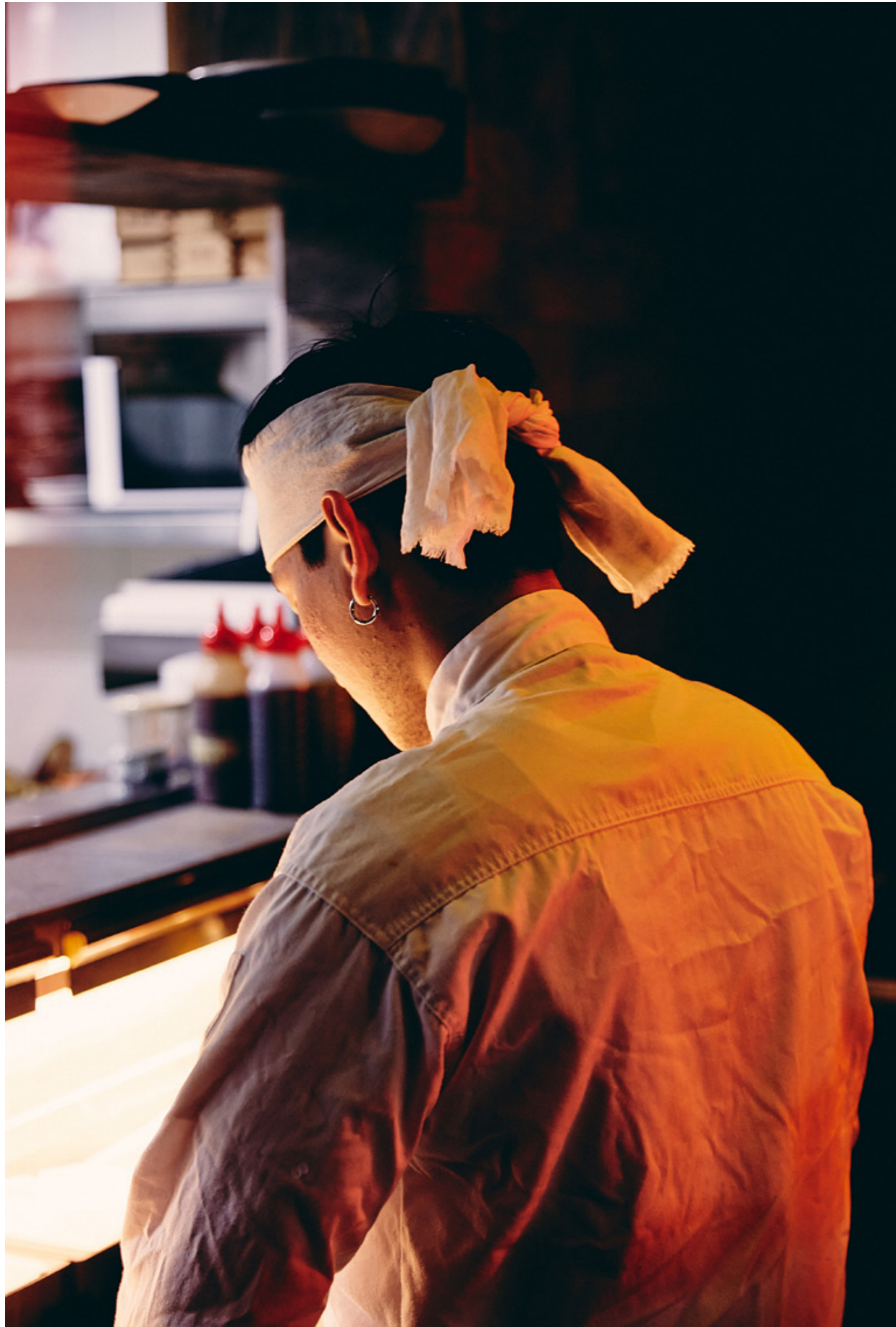
ETSU IZAKAYA (2.2KM / 6MIN DRIVE) MOO MOO WINE BAR (300M / 4MIN WALK)