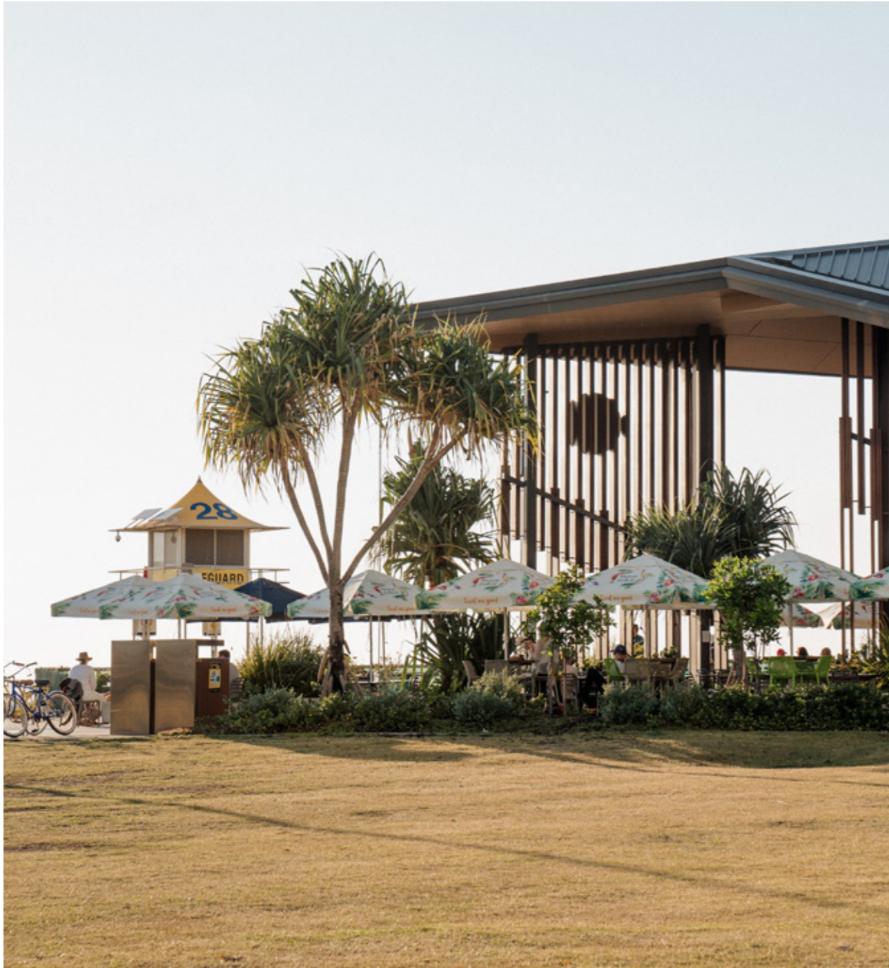
KURRAWA SURF CLUB (300M / 4MIN WALK) PACIFIC FAIR SHOPPING CENTRE (1KM / 4MIN DRIVE)