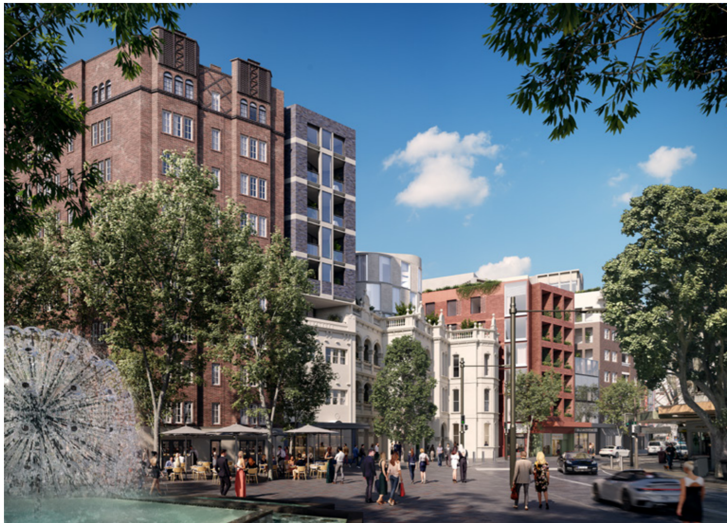
QUEENSGATE, POTTS POINT, SYDNEY EAST END, STAGE 1, NEWCASTLE EAST END, STAGE 1, NEWCASTLE DETAIL CLOVELLY APARTMENTS, CLOVELLY BEACH

V&A represents their largest foray into the Queensland market. It is a bold first step, however, their pedigree in rejuvenating existing urban centres is first class. Their work at East End in Newcastle has delivered a vibrant new neighbourhood where people can live, work, and play with everything they need on their doorstep. V&A will bring the same model to Broadbeach, creating a legacy that will define the area for generations.