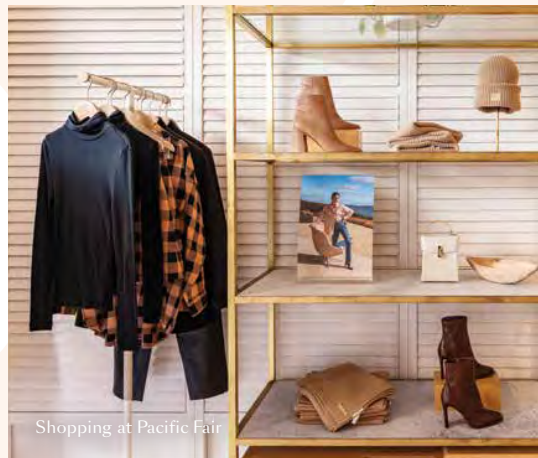
Shopping at Pacific Fair