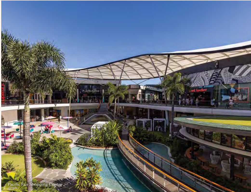
Pacific Fair Shopping Centre