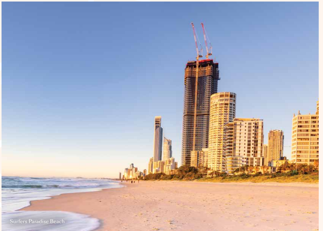
Surfers Paradise Beach

WHETHER IT BE BY RIVER, RAIL OR ROAD, THERE IS AMPLE OPPORTUNITY FOR YOU TO EXPLORE EVERYTHING THE GOLD COAST HAS TO OFFER.